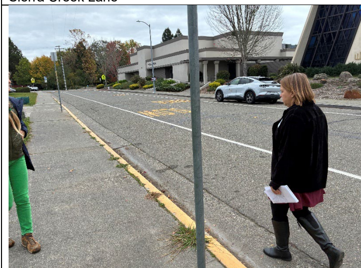
Bus loading zone in front of school