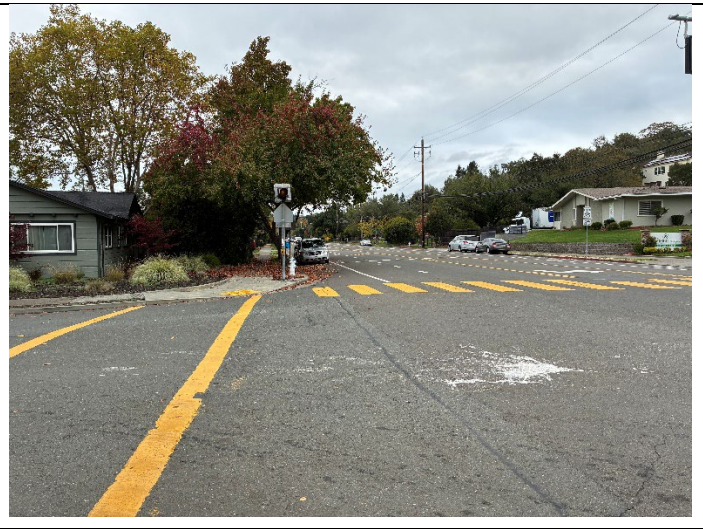
Crosswalk at intersection of Wyoming Drive and Summerfield Road facing north