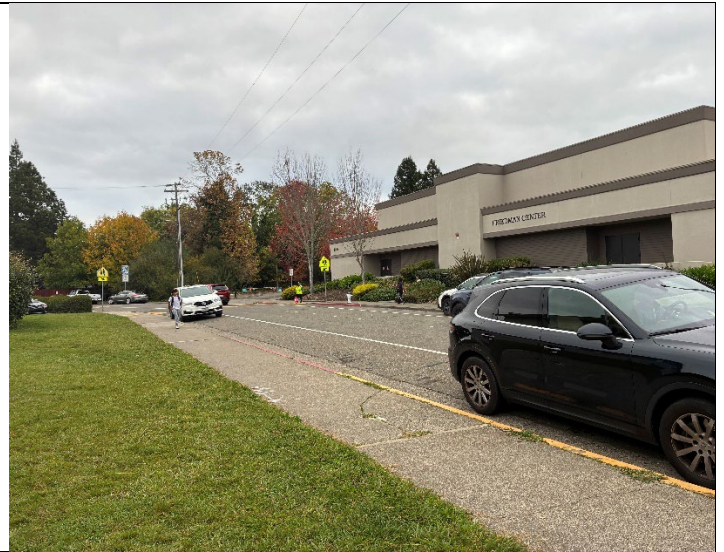
Car in unloading zone in front of school on Mayette Ave