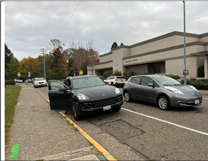
Drop off on Mayette Ave in front of school in bus loading/unloading zone