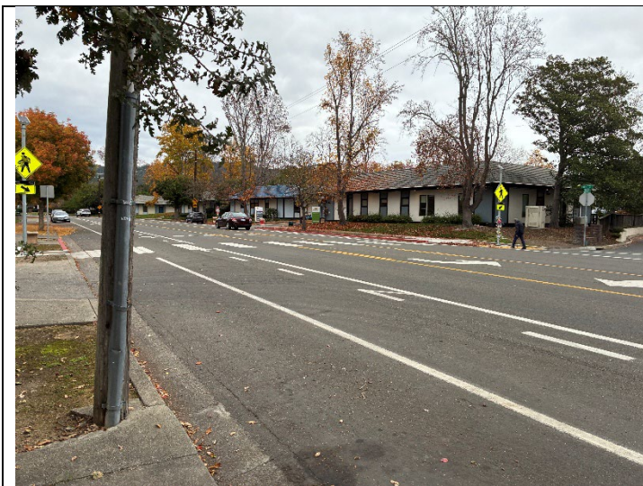
Crosswalk with flashing beacon crossing Hoen Ave at Sierra Creek Lane