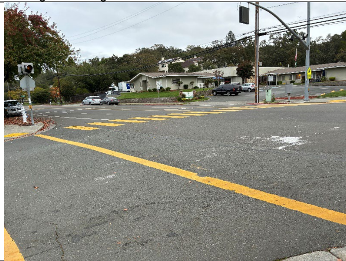
Crosswalk and flashing beacons at intersection of Wyoming Drive and Summerfield Road