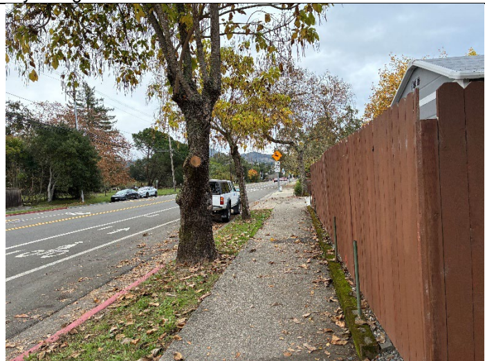
Red curb on Summerfield Road southbound