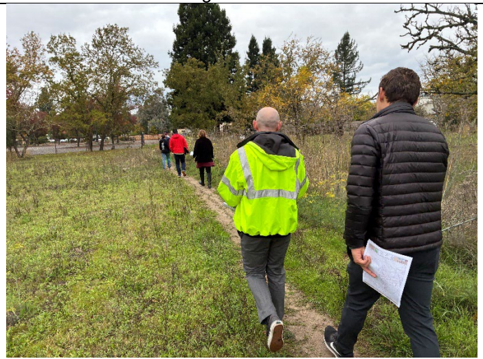
Dirt walking path that connects Mayette Ave with Hoen Ave